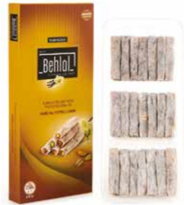
Behlül Vanilla Item Code: 155 Ingredients: Vanillin Pistachio Delight Net Weight: 250 g Brut Weight: 285 g