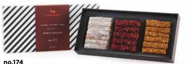
no.174 Ingredients: Behlül Cinnamon, Behlül Zereshk, Behlül Sesame Net Weight: 250 g Brut Weight: 380 g