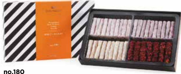
no.180 Behlül Pomegranate, Behlül Black Mulberry, Behlül Orange, Behlül Zereshk Net Weight: 500 g Brut Weight: 700 g