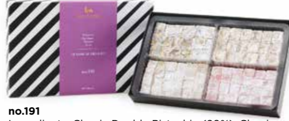
no.191 Ingredients: Classic Double Pistachio (20%), Classic Double Hazelnut (20%), Classic Mastica, Classic Rose Net Weight: 500 g Brut Weight: 700 g