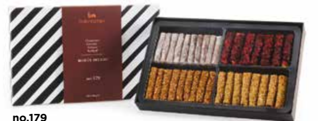
no.179 Ingredients: Behlül Cinnamon, Behlül Zereshk, Behlül Sesame, Behlül Kadayif Net Weight: 500 g Brut Weight: 700 g