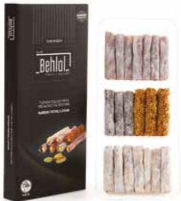
Behlul Mixed Item Code: 159 Ingredients: Mixed Pistachio Delight Net Weight: 250 g Brut Weight: 285 g