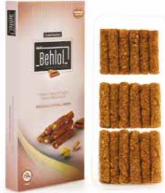
Behlul Biscuit Item Code: 164 Ingredients: Biscuit Pistachio Delight Net Weight: 250 g Brut Weight: 285 g