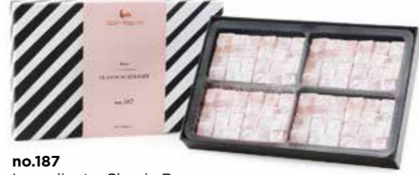
no.187 Ingredients: Classic Rose Net Weight: 500 g Brut Weight: 700 g