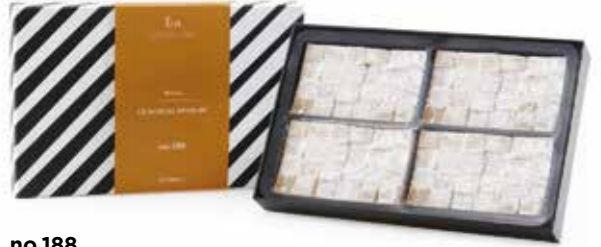
no.188 Ingredients: Classic Mastica Net Weight: 500 g Brut Weight: 700 g