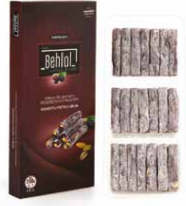
Behlül Black Mulberry Item Code: 157 Ingredients: Black Mulberry Pistachio Delight Net Weight: 250 g Brut Weight: 285 g