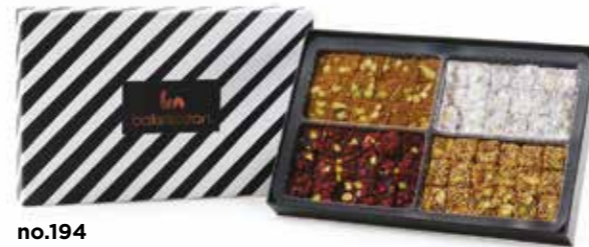
no.194 Ingredients: Classic Double Pistachio Biscuit (20%), Classic Double Pistachio Pomegranate (20%), Classic Double Pistachio Zereshk (20%), Classic Double Pistachio Kadayif (20%) Net Weight: 500 g Brut Weight: 700 g