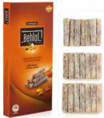
Behlul Orange Item Code: 162 Ingredients: Orange Pistachio Delight Net Weight: 250 g Brut Weight: 285 g