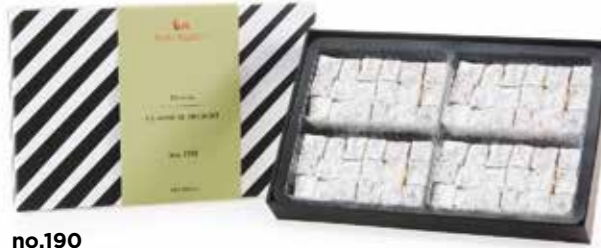
no.190 Ingredients: Double Pistachio (20%) Net Weight: 500 g Brut Weight: 700 g