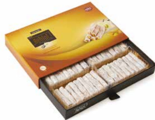
Behlul Vanilla Item Code: 151 Ingredients: Vanillin Pistachio Delight Net Weight: 454 g Brut Weight: 690 g