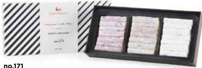
no.171 Ingredients: Behlül Pomegranate, Behlül Vanillin, Behlül White Net Weight: 250 g Brut Weight: 380 g