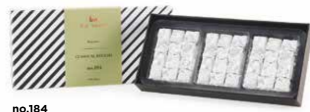
no.184 Ingredients: Classic Double Pistachio (20%) Net Weight: 250 g Brut Weight: 380 g