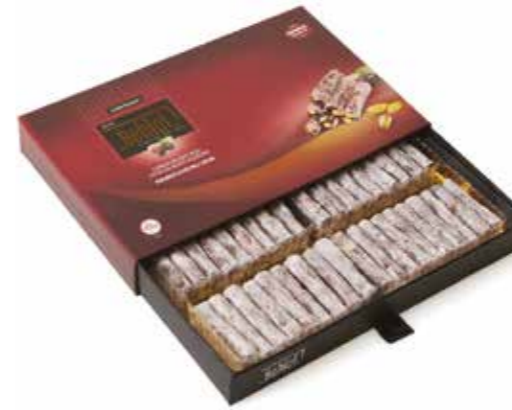
Behlul Black Mulberry Item Code: 153 Ingredients: Black Mulberry Pistachio Delight Net Weight: 454 g Brut Weight: 690 g