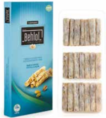
Behlül Mastic Item Code: 161 Ingredients: Mastica Pistachio Delight Net Weight: 250 g Brut Weight: 285 g