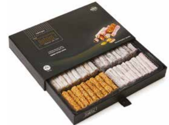
Behlul Confused Item Code: 150 Ingredients: Mixed Pistachio Delight Net Weight: 454 g Brut Weight: 690 g