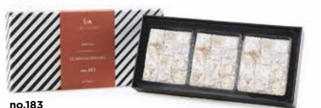
no.183 Ingredients: Classic Pistachio (20%) Net Weight: 250 g Brut Weight: 380 g