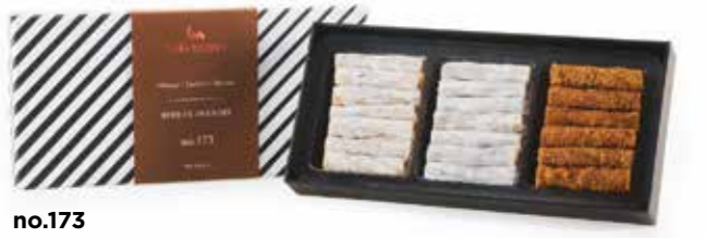
no.173 Ingredients: Behlül Orange, Behlül Vanillin, Behlül Biscuit Net Weight: 250 g Brut Weight: 380 g