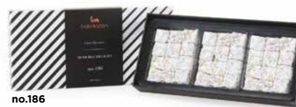
no.186 Ingredients: Duduble Extra Pistachio (40%) Net Weight: 250 g Brut Weight: 380 g