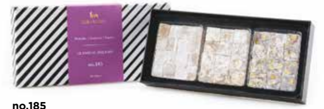
no.185 Ingredients: Classic Double Pistachio (20%), Classic Double Hazelnut (20%), Classic Mastica Net Weight: 250 g Brut Weight: 380 g