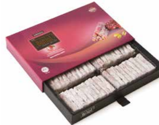
Behlul Pomegranate Item Code: 152 Ingredients: Pomegranate Pistachio Delight Net Weight: 454 g Brut Weight: 690 g