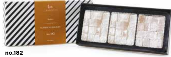
no.182 Ingredients: Classic Mastica Net Weight: 250 g Brut Weight: 380 g