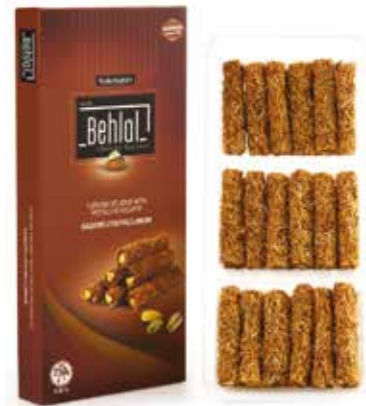
Behlül Kadayif Item Code: 158 Ingredients: Kadayif Pistachio Delight Net Weight: 250 g Brut Weight: 285 g