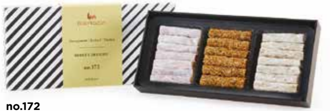
no.172 Ingredients: Behlül Pomegranate, Behlül Kadayif, Behlül Mastica Net Weight: 250 g Brut Weight: 380 g