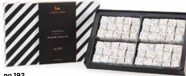
no.192 Ingredients: Duduble Extra Pistachio (40%) Net Weight: 500 g Brut Weight: 700 g