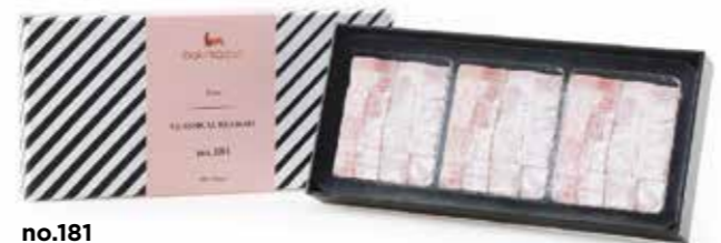
no.181 Ingredients: Classic Rose Net Weight: 250 g Brut Weight: 380 g