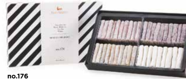
no.176 Ingredients: Behlül Pomegranate, Behlül Black Mulberry, Behlül Vanillin, Behlül White Net Weight: 500 g Brut Weight: 700 g