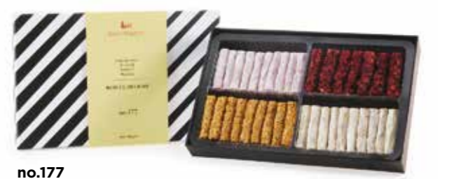
no.177 Ingredients: Behlül Pomegranate, Behlül Zereshk, Behlül Kadayif, Behlül Mastica Net Weight: 500 g Brut Weight: 700 g