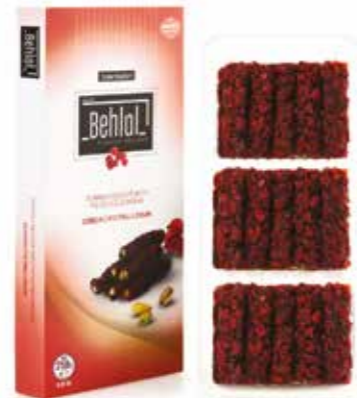
Behlul Zereshk Item Code: 163 Ingredients: Zereshk Pistachio Delight Net Weight: 250 g Brut Weight: 285 g