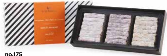
no.175 Ingredients: Behlül Pomegranate, Behlül Black Mulberry, Behlül Orange Net Weight: 250 g Brut Weight: 380 g