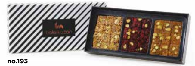
no.193 Ingredients: Classic Double Kadayif Pistachio (20%), Classic Double Pistachio Zereshk (20%), Classic Double Pistachio Biscuit (20%) Net Weight: 250 g Brut Weight: 380 g