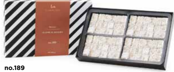
no.189 Ingredients: Classic Hazelnut (20%) Net Weight: 500 g Brut Weight: 700 g