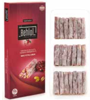
Behlül Pomegranate Item Code: 155 Ingredients: Vanillin Pistachio Delight Net Weight: 250 g Brut Weight: 285 g