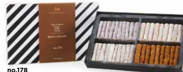
no.178 Ingredients: Behlül Black Mulberry, Behlül Orange, Behlül Vanillin, Behlül Biscuit Net Weight: 500 g Brut Weight: 700 g