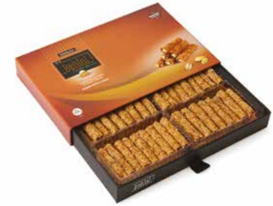
Behlul Kadayif Item Code: 154 Ingredients: Kadayif Pistachio Delight Net Weight: 454 g Brut Weight: 690 g