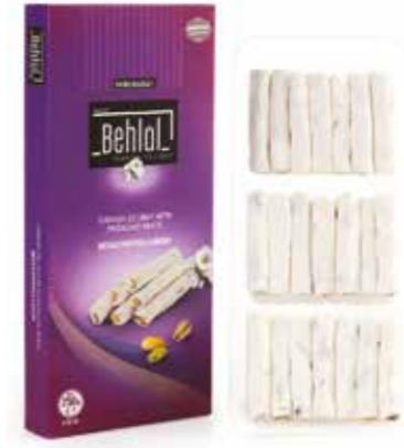
Behlül White Item Code: 165 Ingredients: White Pistachio Delight Net Weight: 250 g Brut Weight: 285 g